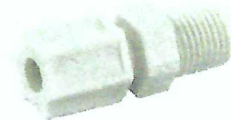
Plastic Compression fitting * Available with Drain Chief Plus only