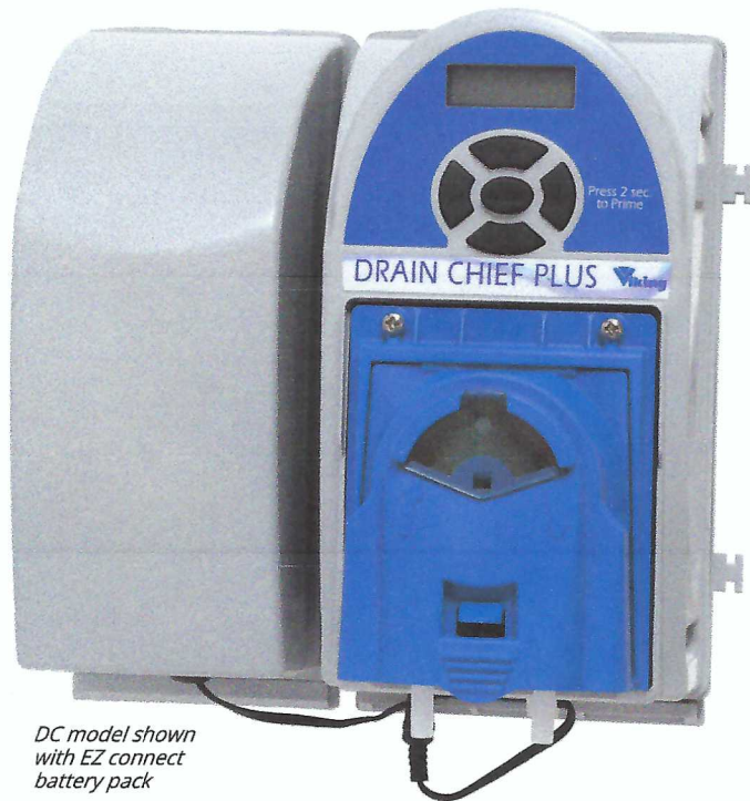
DC model shown with EZ connect battery pack

Dispensing Systems For Grease-Digesting Chemicals (Bacteria, Enzyme, Solvent) & Odor Suppression Chemicals